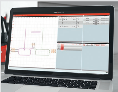
Guidance control for the MATIC fleet