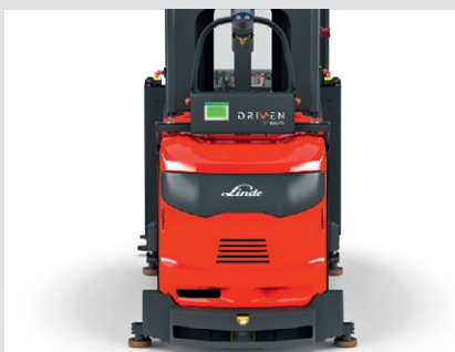
7 inch screen – see everything at a glance