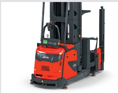
Maximum safety thanks to all-round monitoring